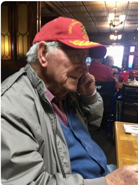
Papa at his favorite restaurant Jay's