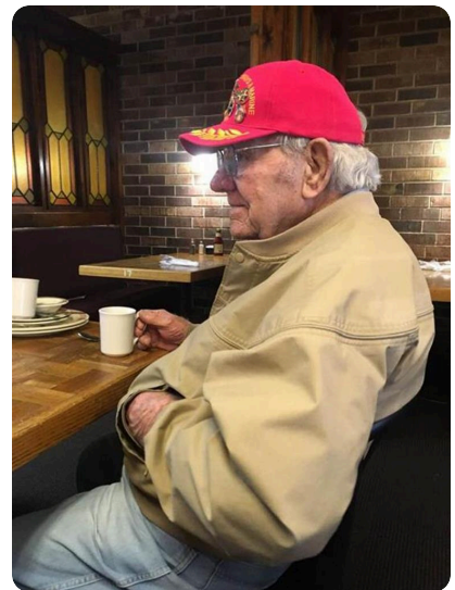
Papa at Jay's